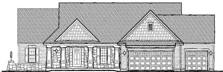
ALTERNATE FRONT ELEVATION